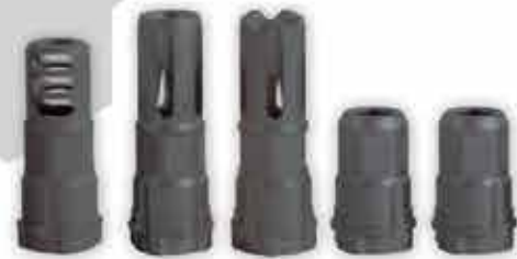
(Photos above are typical representations of accessory designs and are not shown to scale)